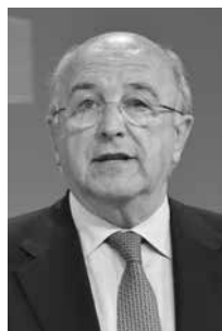
Prof. Dr. Joaquín Almunia

Former Vice-President, European Commission, Brussels, Belgium